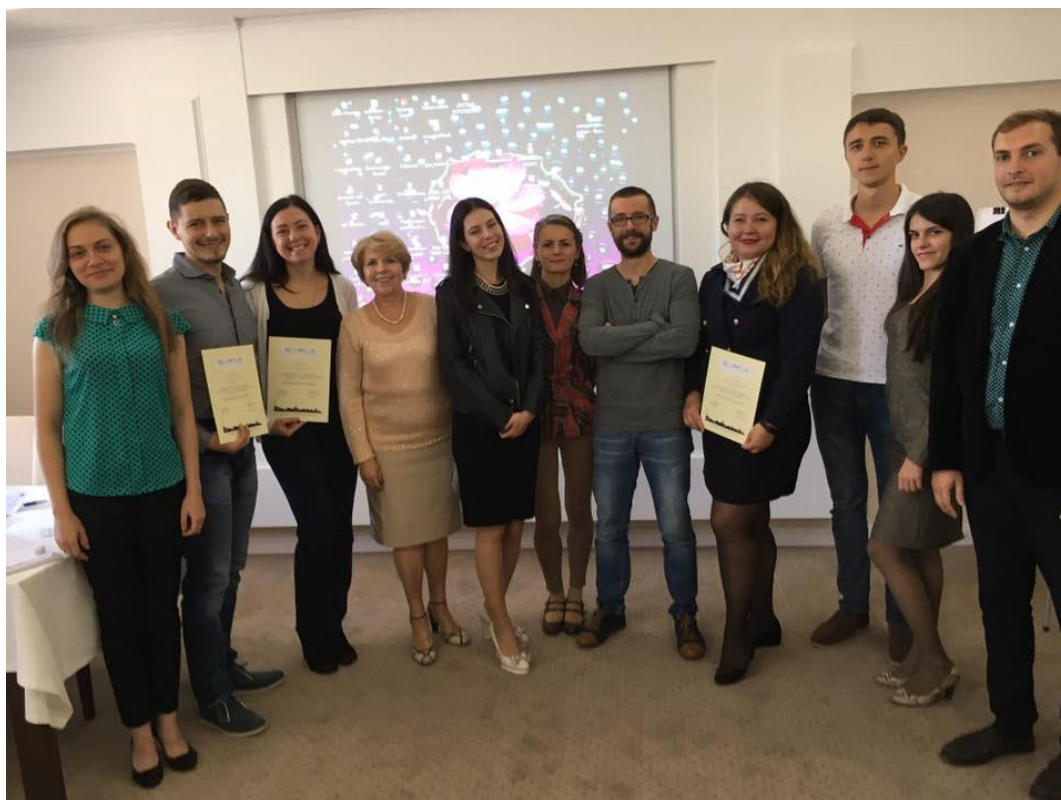
Training 'How to write a successful proposal in Horizon 2020?' National Aviation University, Kyiv, February 14, 2018, Kyiv